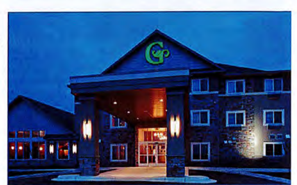
An example of a GrandStay Property.

The EDC facilitated and contributed financially to a hotel feasibility study with LCCC, which found a need in the New London-Spicer area for lodging to replace the many small resorts that have closed over the years.