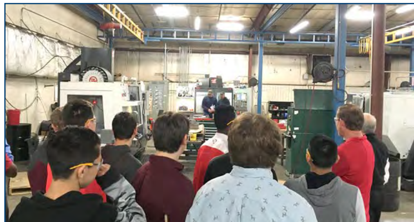
Students tour the Chappell Central facility in Willmar.

Businesses that participated were RELCO, Nova-Tech Engineering, Inc., Lange Ag Systems, Inc., Epitepox, Jennie-O Turkey Store, Central Minnesota Fabricating, West Central Steel, and Chappell Central. The business leaders contributed to the event by paying for busing, providing tour guides and submitting material for a video that was created to further showcase local manufacturing. The tours were in preparation for career education and exploration training provided to all high school students and was planned and supported by the EDC's Business Retention and Expansion/Recruitment Committee and the Willmar Lakes Area Vision 2040 Goal Two, which is Economic Diversity. Willmar High School hopes to continue the tours in upcoming years.