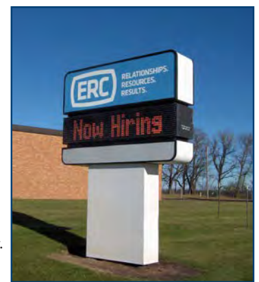
A new sign marks the entrance to the ERC Holdings building.