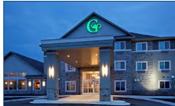
An example of a GrandStay Property.

The EDC prepared and submitted a Job Creation Fund (JCF) application to the Minnesota Department of Employment and Economic Development (DEED) on behalf of ERC in late September. ERC was awarded more than $560,000 from the State of Minnesota for the Willmar project. The money will be used to offset costs associated with building improvements and hiring new employees.