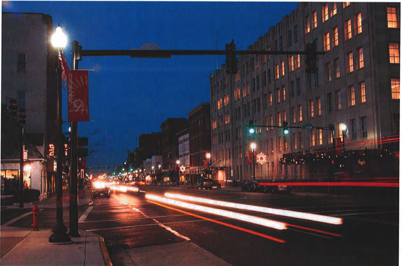
South Main St. in Findlay, Ohio

Northwest Ohio's perennial juggernaut shows how it's done, again.