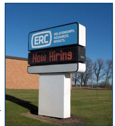
A new sign marks the entrance to the ERC Holdings building.

The EDC prepared and submitted a Job Creation Fund (JCF) application to the Minnesota Department of Employment and Economic Development (DEED) on behalf of ERC in late September. ERC was awarded more than $560,000 from the State of Minnesota for the Willmar project. The money will be used to offset costs associated with building improvements and hiring new employees.