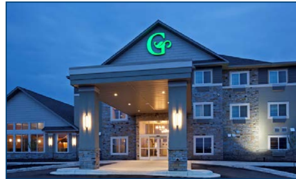
An example of a GrandStay Property.