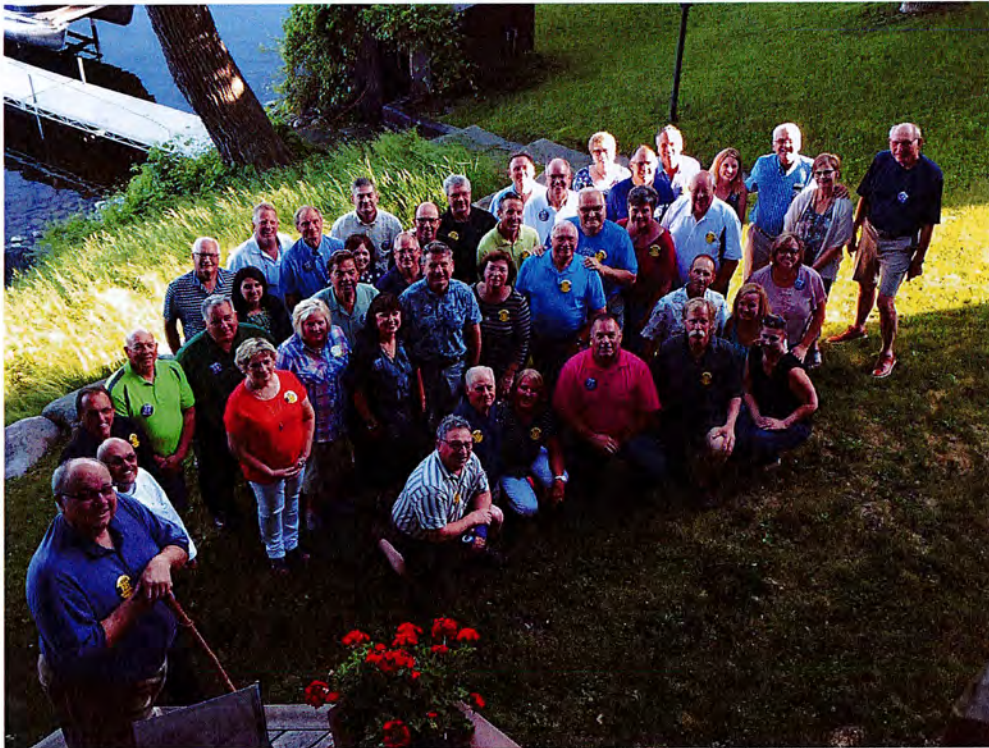
Hwy 23 Coalition Celebration on June 6th