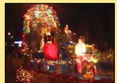
Lighted Floats in the Holiday Parade

Opportunities for growth are everywhere, even while our residents maintain our better pace and quality of life. If you're ready to move here as well, please call the EDC at 320-235-7370 or 888-815-7370 or visit our website @ www.kandiyohi.com to learn how to get matched up with local employers!