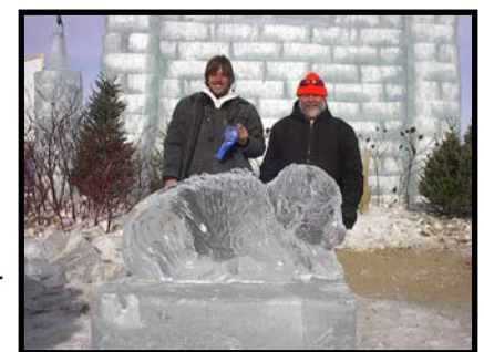
Winners of the past WinterFest ice sculpture contest