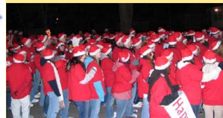
Carolers sing in the recent Holidaze Parade