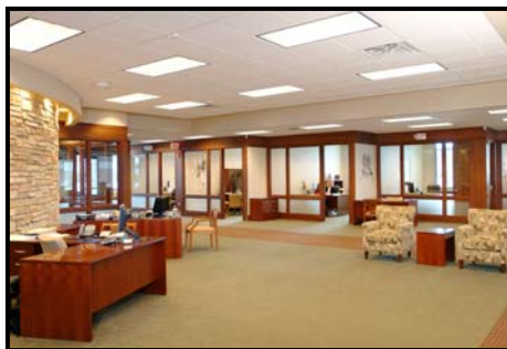
Home State Bank lobby, Willmar