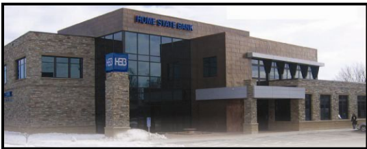
Home State Bank building, Willmar

The new Home State Bank building was completed in January 2006 and has further added to the positive growth Willmar’s east side has experienced during the past several years. This growth includes a three-year-old 50,000 square foot YMCA facility, several new commercial/